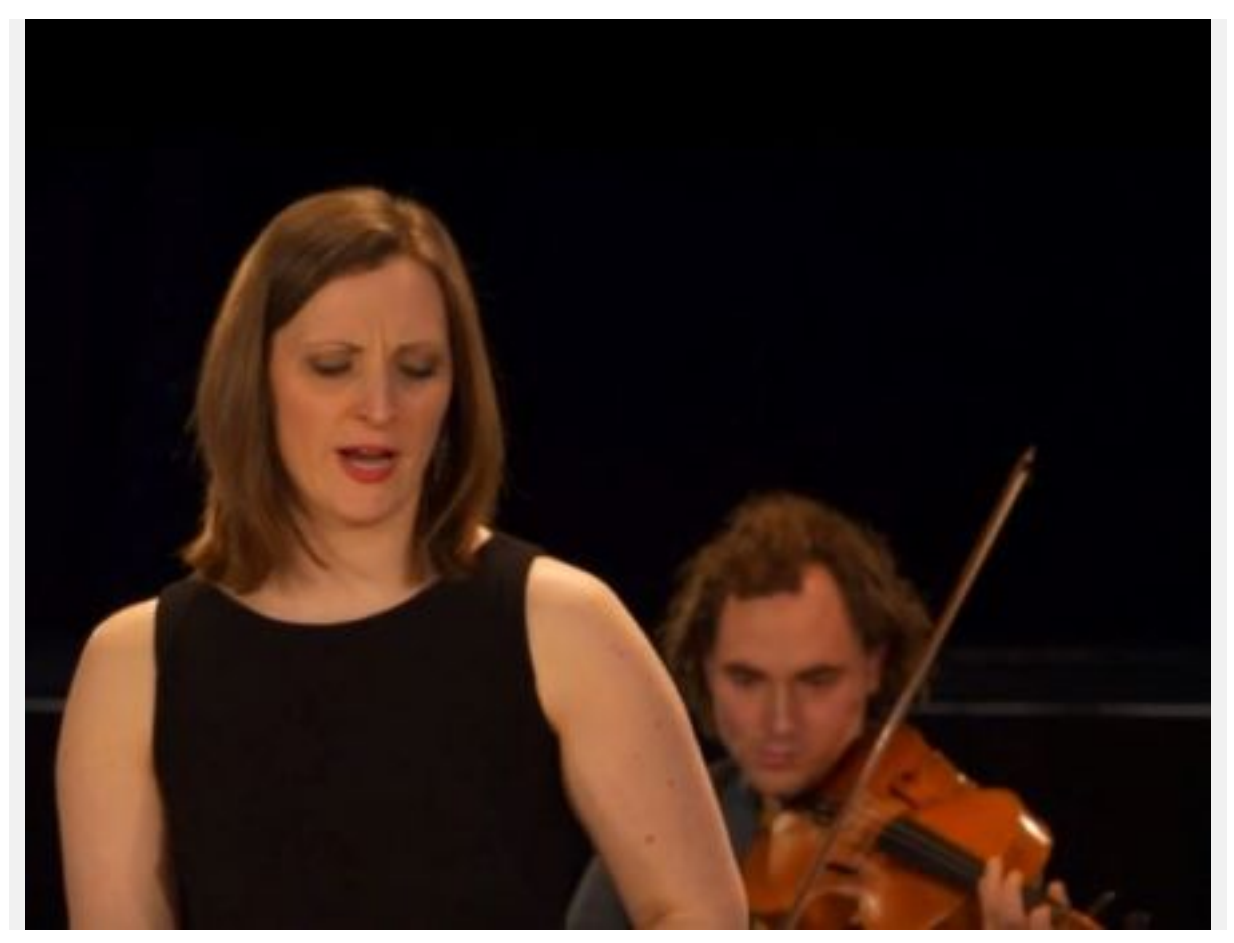
Screenshot online premiere